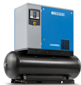
Tank Mounted version with integrated dryer