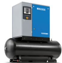
Tank Mounted version without dryer