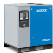
Floor Mounted version without integrated dryer